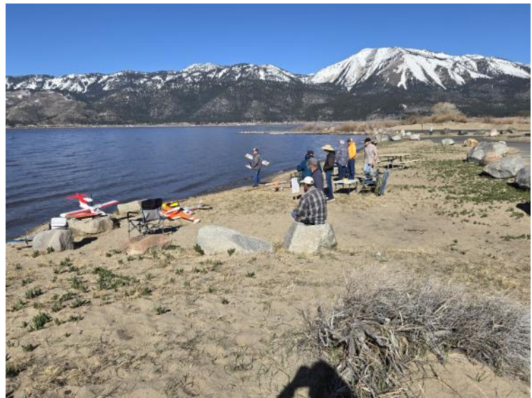
Another beautiful day in paradise