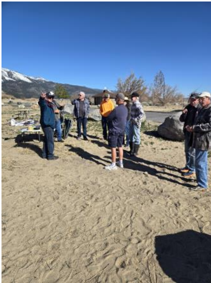
Let the meeting begin...