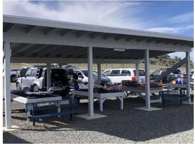
Lots of planes and cars