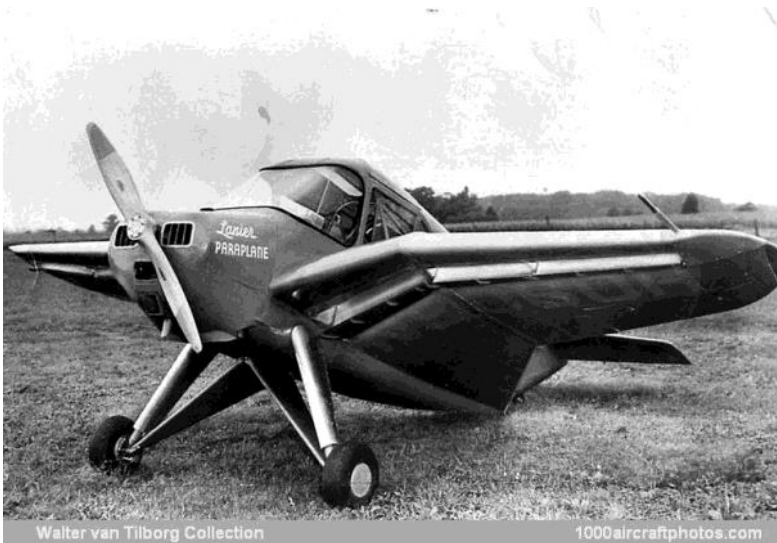
Walter van Tilborg Collection

The Paraplane had a wingspan of 20 feet 7 inches, length of 21 feet, useful load of 500 pounds, achieving a ceiling of 23,000 feet. Five Lanier Paraplanes were built.