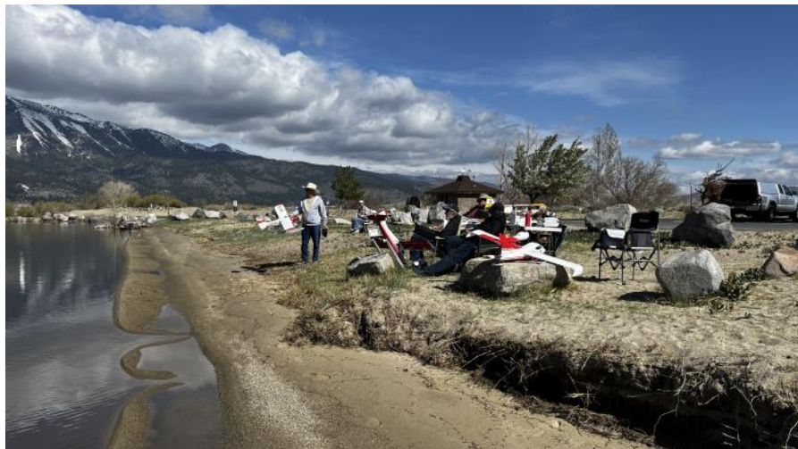
Rich E joined us with his Cub, a nice way to start the season

Mother Nature welcomed 8 flyers to her beach (all two feet) for a day of float flying. All of us had multiple flights and we finally called it a day and headed home. No crashes or recoveries so everyone was smiling. People at the Pony Express Airpark complained it was too windy but look at the lake!