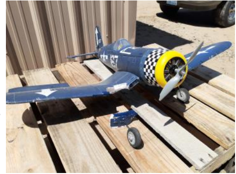
Picture of the hard landing results

Fellow members. I enjoyed the swap meet and was fortunate to pick up a blue Corsair electric plane. I learned several things from this experience. Swap meets are a great thing and if you buy a blue plane you will have a hard time seeing it against a blue sky. This was my first low wing plane and it flew (note the past tense here) differently than my trainer. This resulted in a hard landing up on the hill in the sagebrush. Those present referred to it as a crash ( I prefer hard landing).