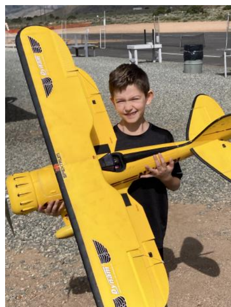
Pilots and Planes