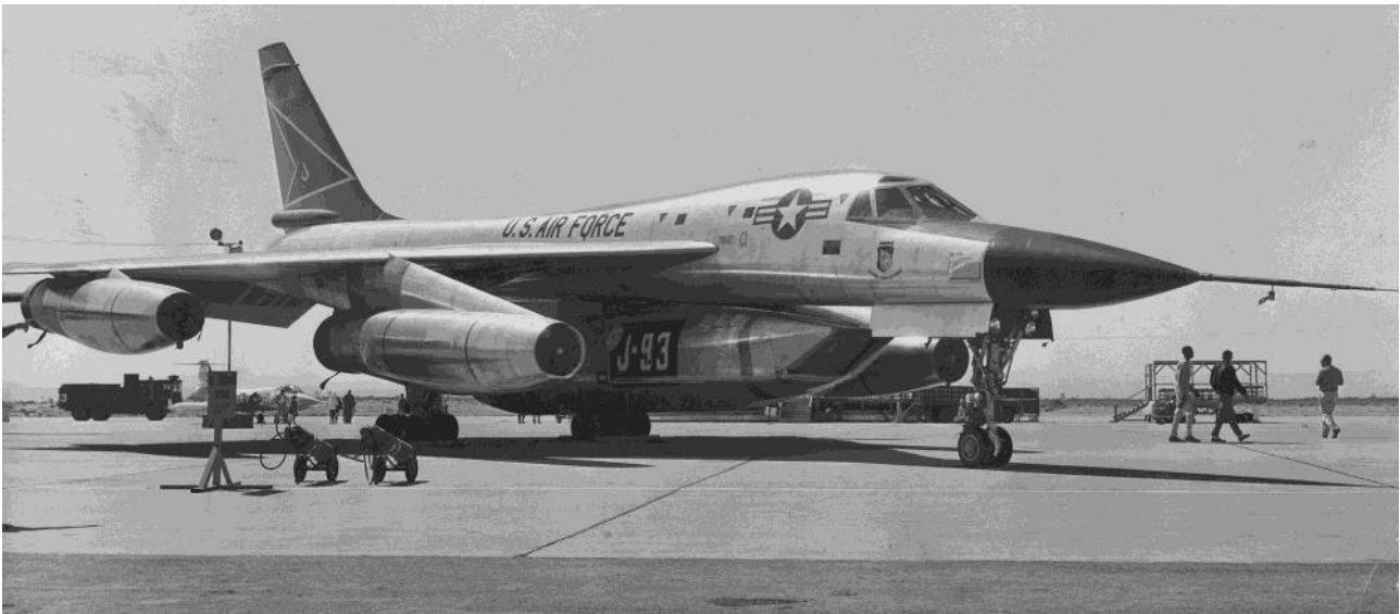
Convair B-58 Hustler

It was not an easy aircraft to fly. Because of the 60 degree delta wing, it needed a 14 degree angle of attack to take off with a speed of 234.2 mph. It also had "fuel stacking" problems. This was fuel sloshing forward and backward when accelerating and decelerating causing the CG to shift. This could cause the B-58 to abruptly pitch up or bank resulting in loss of control.