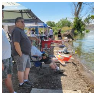
Lake Lahontan + tree