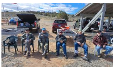
Geezers rolled out too.

Why some people needed a trailer for the Roll Out event.