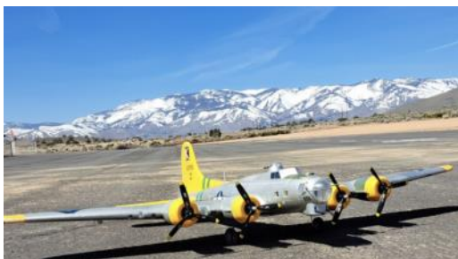
"the Beauty and the Beast," George's B-17