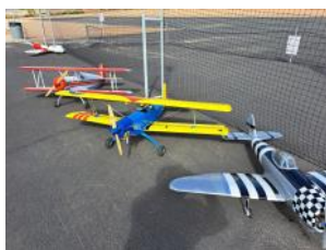
One or two wings, it doesn't matter.