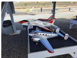
Birds of a feather...

Why some people needed a trailer for the Roll Out event.