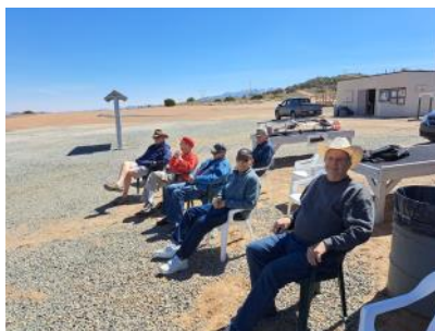
It is "gallery time" again now that Mother Nature has given us a taste of sunshine without any snow around.)