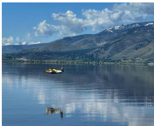
Paul's Grumman Albatross