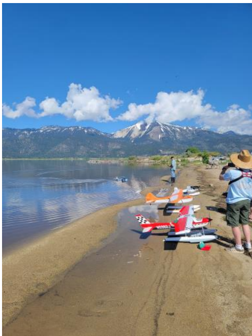
Washoe Lake beachfront property