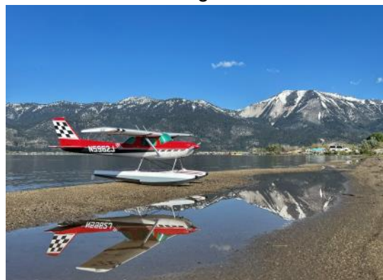
Ed's foam Cessna 150, pictures don't get much better than that.