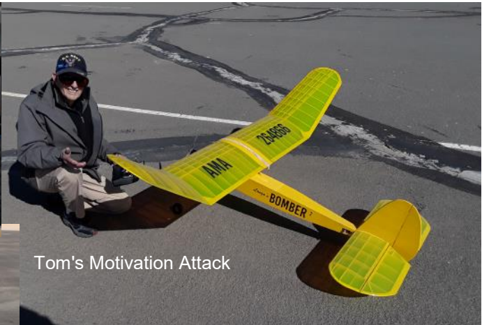
Tom's Motivation Attack