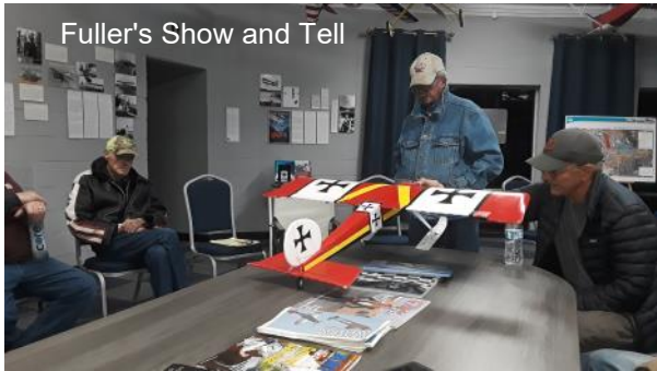
Fuller's Show and Tell