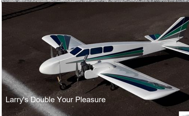
Larry's Double Your Pleasure