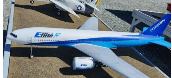
Commercial Boeing Jet