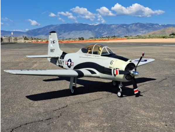
Dan Ortiz' T 28 before the maiden Flight