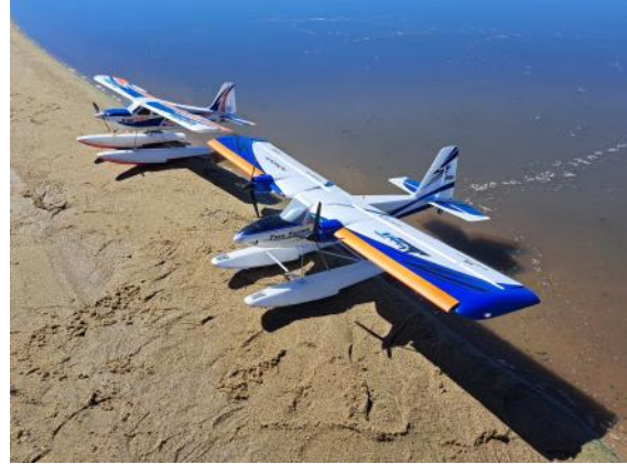
Tom's Timber Twin next to a Kingfisher on maiden flight day