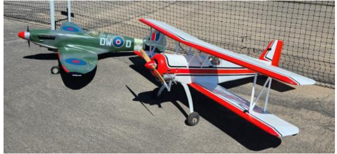
Lance's Spitfire and Super Aeromaster