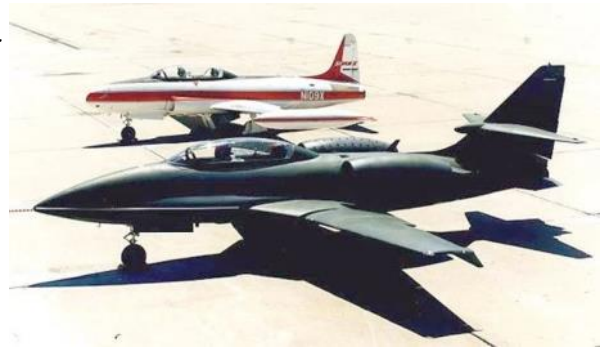
The Skyfox was derived from the T-33 Shooting Star airframe.

Only one prototype was ever built and it was lost when it collided with a Piper Cub over Lake Hartridge near Winter Haven, Florida.