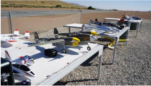
Isn't that a Radian tail sticking out of the Trash Barrel?