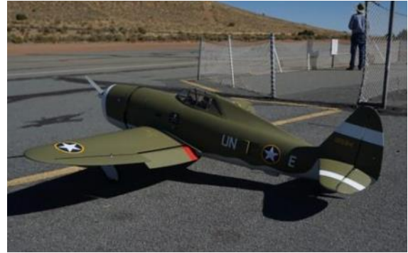
A Reno Club P-47 at our field.