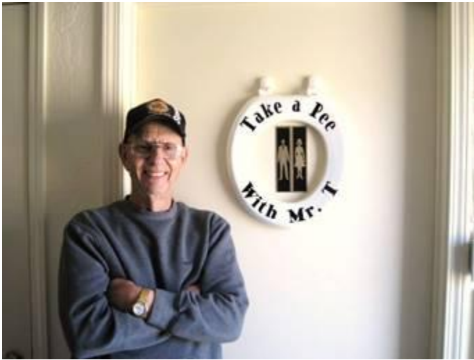
The motley crew!