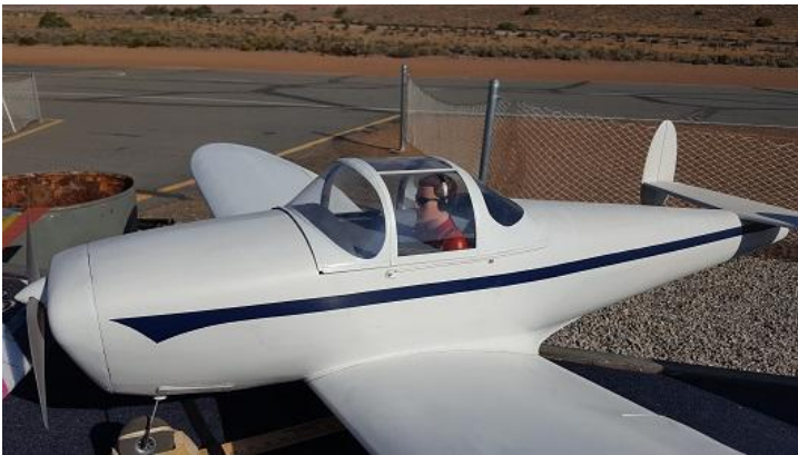
<===== Bob's Ercoupe. Light as a feather!