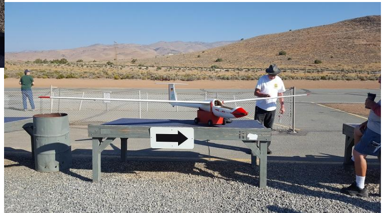
We need wider tables! Louie's Glider =====>