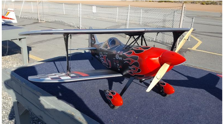
Gene's foamy. Flies great!