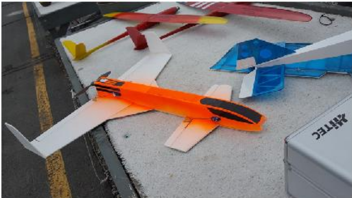
Collection from Dave Triano