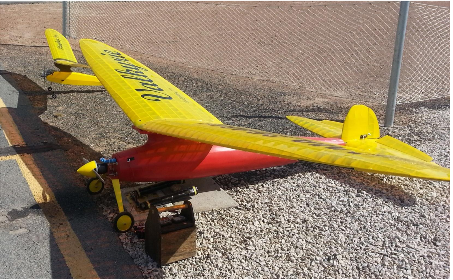
Tom's Valkyrie was impressive to watch. Both Tom's planes pictured here flew great!!