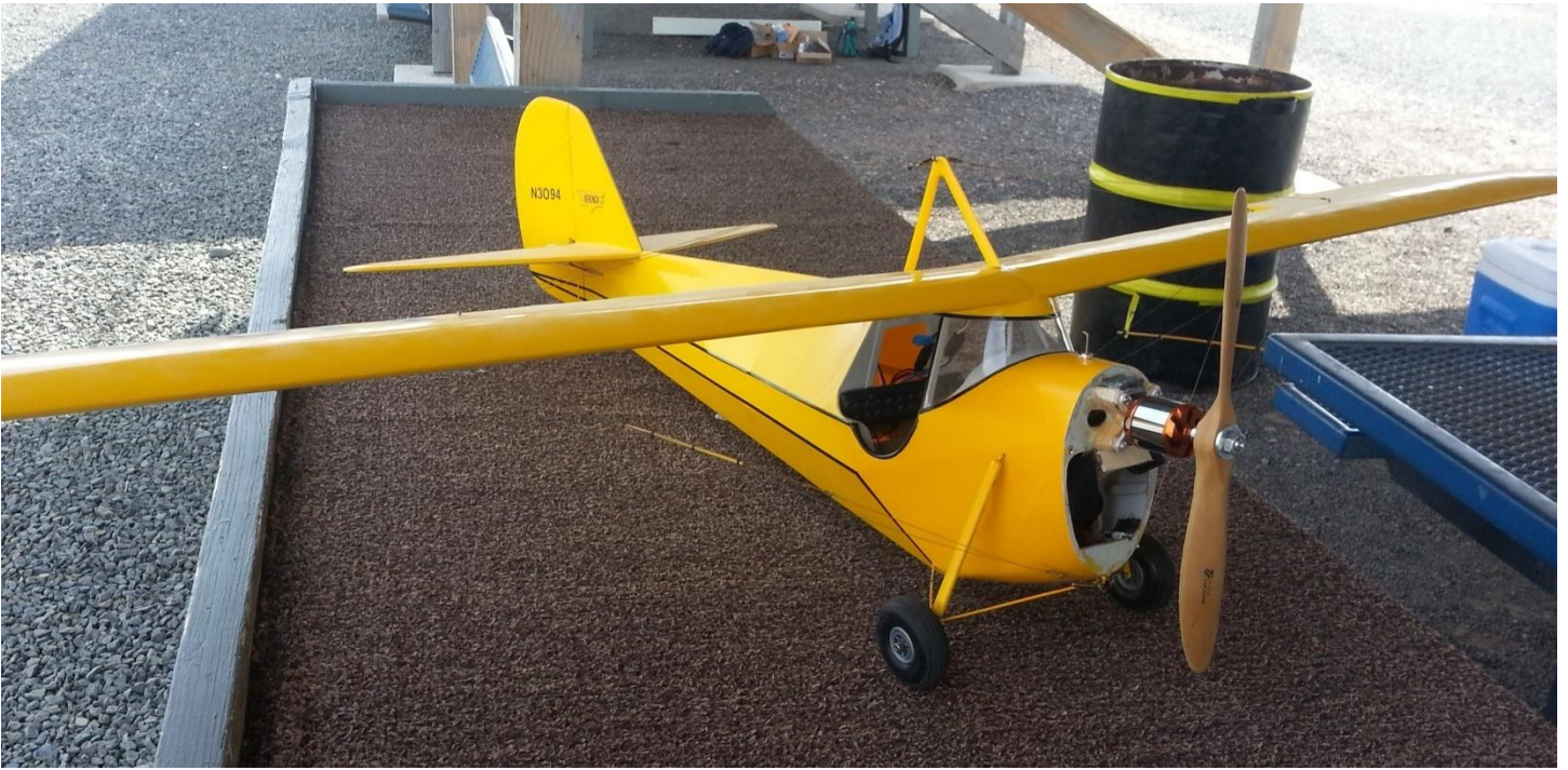
Model of 1933 Aeronca C-3 Originally built by Ralph littler of HSRCC approx 20+ years ago, built from plans. Converted from glow to electric 2015. (Cowlings and final finish due to be completed sometime before the next 20 years)