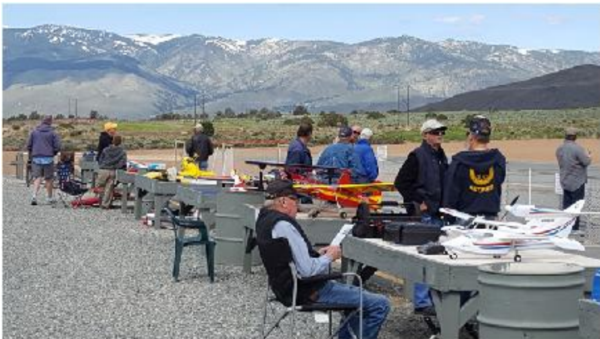
A little flying before the strong winds and some casual story telling