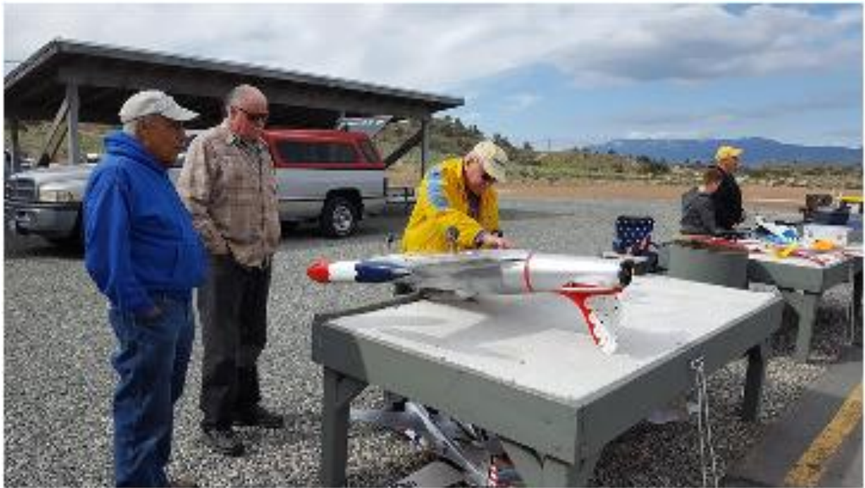
Don's Shooting Star with Red Bull P-38 and P-39 Aircobra under the bench