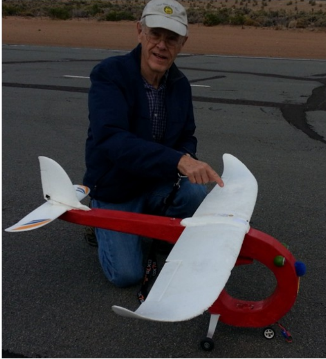
Roger's "Number 9"

While Dan Etcheto and Bob Sullivan started their day by replacing a one of the rotted table tops, others enjoyed the unexpected pleasant flying conditions.