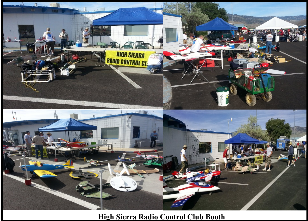
High Sierra Radio Control Club Booth