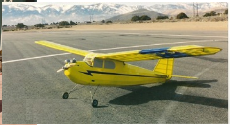
And of course... there was a Telemaster in 1993.

You have to start somewhere. Nothing like a Gentle Lady for a first plane. This was just the beginning in 1992.