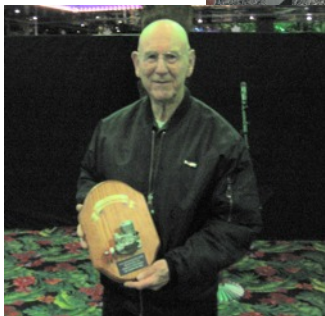
Masters of Swizzle-Sticks