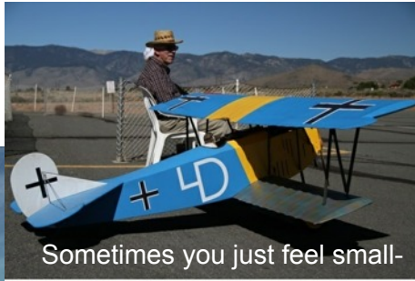
Sometimes you just feel small-