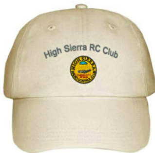
The official HSRCC Club Cap -Tan $15.00