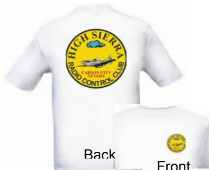
The official HSRCC Club Tee Shirt - White $20.00