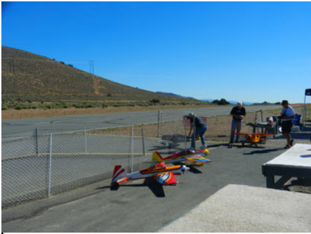
The pit was busy as visitors got their planes ready to fly. There were some beautiful models on the line.