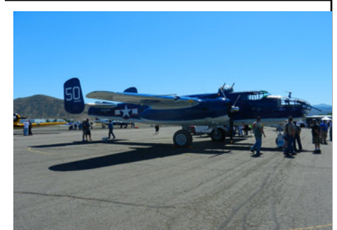
Good Subject for next years contest. Think about it!- BJ