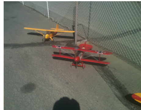
A couple of the small birds are ready, but the big birds prevailed.