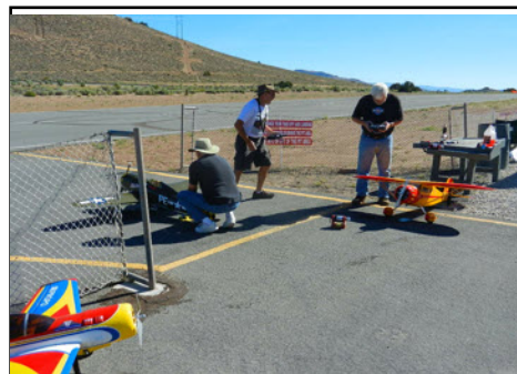
More action on the flight line. The Gardneville crew always step up with great planes and flying.