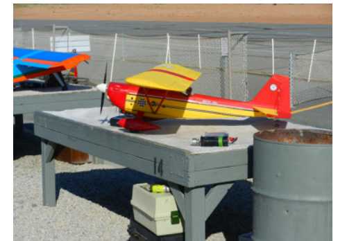
The President's Citabria Pro is ready to compete.... More or less. Citabria lost out to the Extra 500.