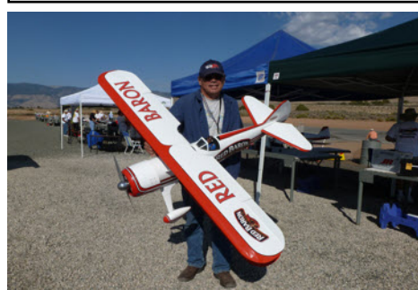
"Mr. Number One" and the Super Stearman