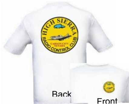
The official HSRCC Club Tee Shirt - White $18.00

70 YEARS AGO... At the Carson High School Assembly, 30 certificates were presented to 18 high school boys who participated in a scale model aircraft project sponsored by the Bureau of Aeronautics of the U.S. Navy. The models were used to train Navy fliers.