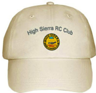
The official HSRCC Club Cap -Tan $15.00