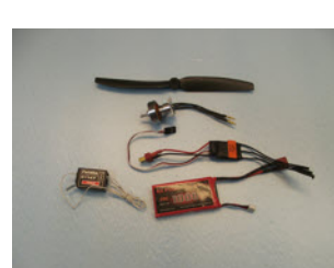
Here are the parts laid out for the Zero to oppose the Wildcat. It will have the same specifications as the Wildcat so their flight characteristics should be similar. Each plane will tow a streamer one inch wide and about 15 feet long. Both planes use two 9 gram servos for ailerons and elevator. Cost per plane should be about *30.00. Stay tuned....and watch your six! -BJ.

Gomez Gold at the next meeting ... $77.00