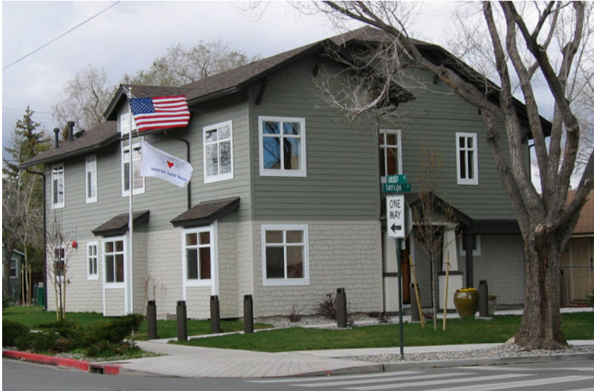
The Guest House is located at 800 Locust Street in Reno. A new addition has been opened next door.