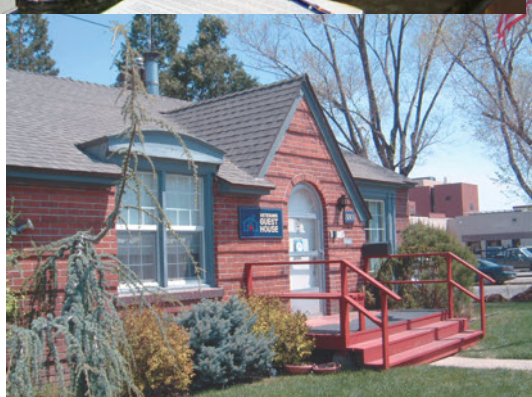
The original Guest House opened in 1994.

The physical amenities of the house allow provision of the intangible comforts of a warm, caring and supportive home, at a time when the veteran or family member is dealing with other pressing issues. Guests are asked to make a small donation to help defray the operating costs for the house. However, no otherwise qualified person is refused accommodations for lack of funds.