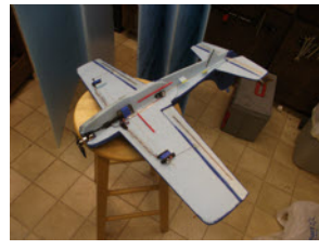
Aerial Combat anyone.... Here are some pics of my foamie Wildcat built for combat and successfully test flown by Les Harris. It has a w.s. of 30" , weighs 8.6 oz ready to fight and is powered by a 1700 kv brushless motor, 10 amp controller and a 1000 mah battery. The foam material is called protection board. It approximately .25 " thick and comes in a sheet 4'x 50' long fan folded.