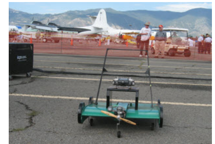
Cutting-edge technology to end the show. Les mowed them