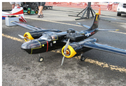
Don Morse's B-26 on the flight line.