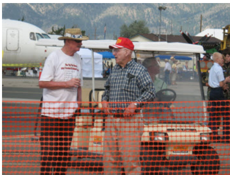
A couple of members discuss luncheon plans.