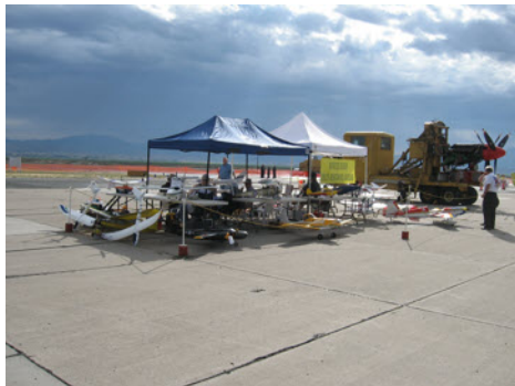
Open and ready for business. Notice the clouds and the Merlin-Griffon in the background.