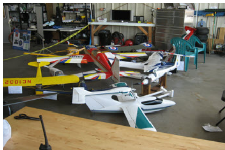
All tucked in for the night. End of a great day....