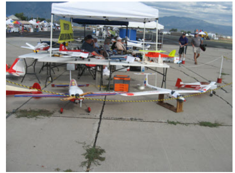
We had a great display of models with lots of variety.