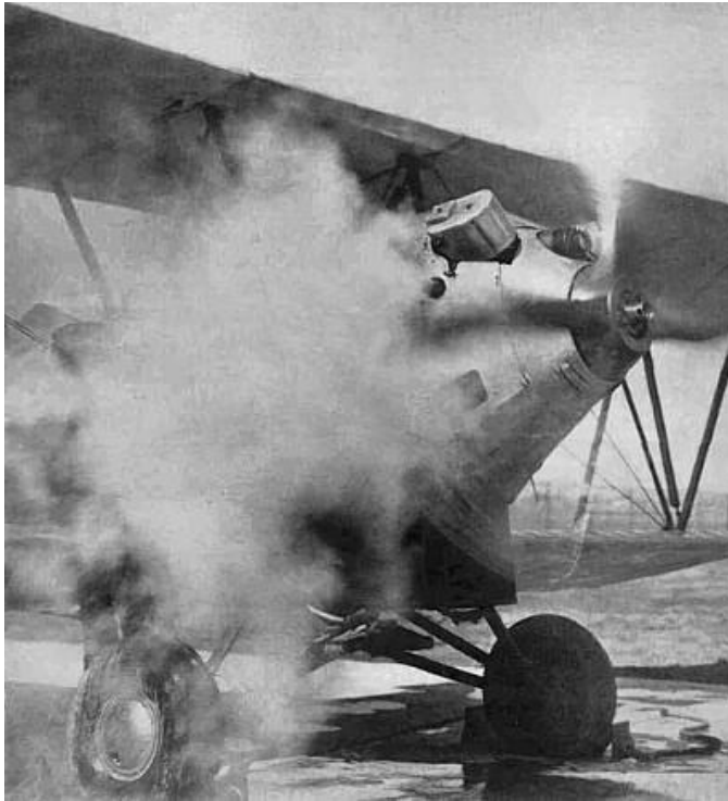
The Besler Steam Plane

A Travel Air 2000 biplane made the world's first piloted flight under steam power over Oakland, California, on 12 April 1933. The strangest feature of the flight was its relative silence; spectators on the ground could hear the pilot when he called to them from mid-air. The aircraft, piloted by William Besler, had been fitted with a two-cylinder 150 hp reciprocating engine.