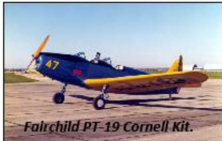
Fairchild PT-19 Cornell Kit.

Raffle Tickets on sale now. 1 for $1.00 or 6 for $5.00