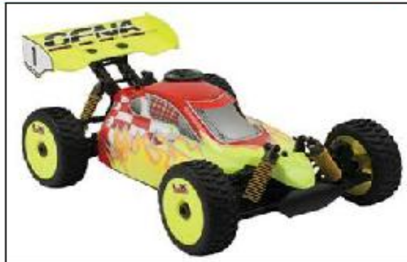
OFNA's LX One RTR - 1/8th Nitro Buggy.