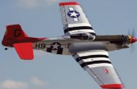
Hangar 9's P-51 Mustang Mk II PTS.

!! Get your tickets now for a chance to win one the following cool prizes !!