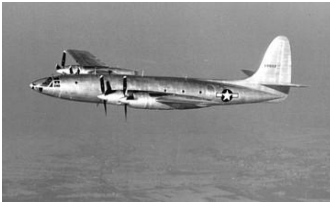
Republic XF-12 / XR-12 "Rainbow"

Next Meeting – November 11 th , at Round Table Pizza on College Pkwy – 6:30 pm