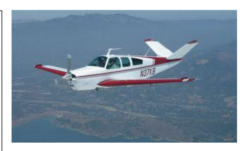
Beech Bonanza V35A

Why is it that people say they "slept like a baby" when babies wake up like every two hours?