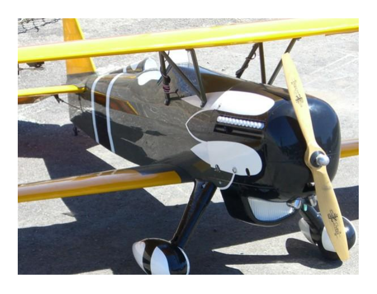
The side by side comparison test. Which is which and who's is who's?