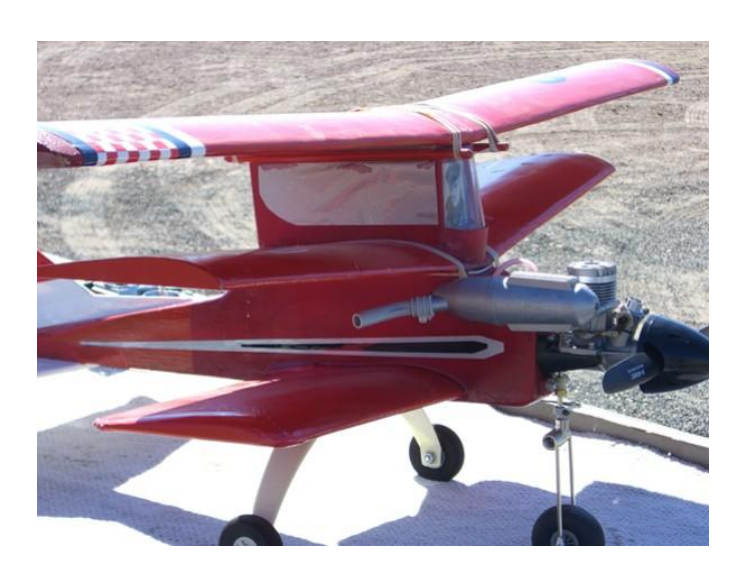
A kind of wanted to see this fly, didn't you?