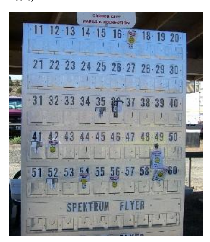
Tony, you out did yourself! Thank you so much!

Here is a picture of the new frequency board (in case you have been on the moon for the last couple of weeks)