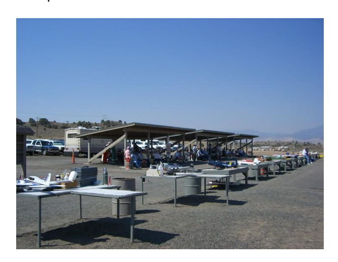
It's a beautiful day in the neighborhood!

Great! Now I have that bloody song in my head.